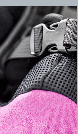
Quilted cover in a range of colours