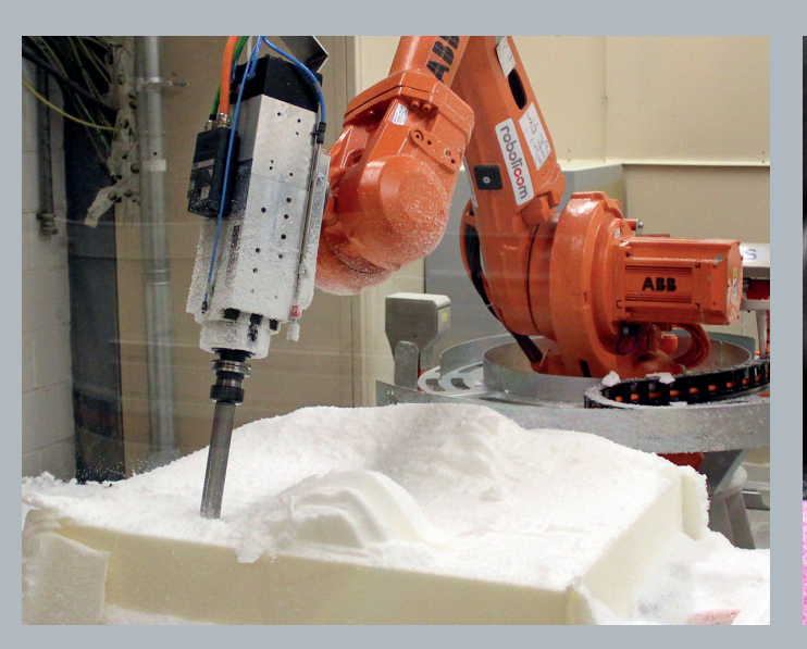
7 Axis robot carved high density HR foar